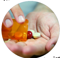
Treatments: The basics